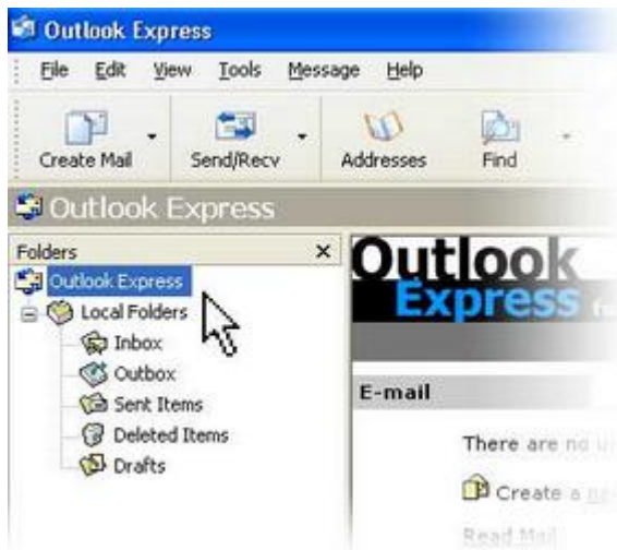
Outlook Express list of folders

If you don't see the list of folders and contacts on the left, click Layout on the View menu. Click Contacts and Folder List to check them, and then click OK .